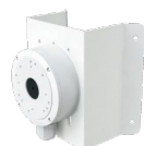
AVM-P-CMT (Junction Box Not Included)